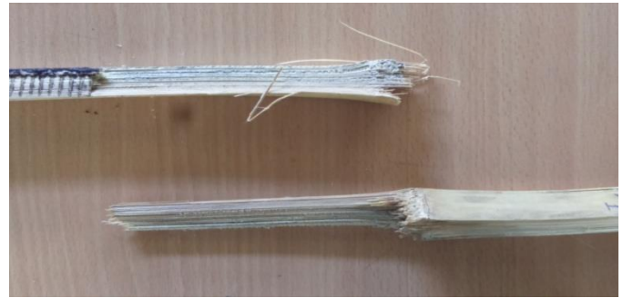
Fig 2: Failure of specimen due to axial load.

Specimens were loaded under the UTM to know the pattern of failure of specimens under loading. The following pattern was observed; specimens with nodes in between failed exactly at the nodes and specimens without nodes in between showed ductile nature and then failed. Through the investigation it was observed that the density of fibers at the nodes was more. Some specimens failed due to excessive compression in between the jaws. The failure pattern of specimen is shown in fig