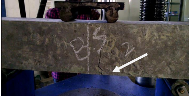
Fig 4: Initiation of failure pattern

Casted beams were carefully placed under the UTM with a special arrangement to induce two-point loading as in fig; and the failure pattern was observed;