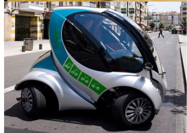
ULTRA NANO E-CLASS