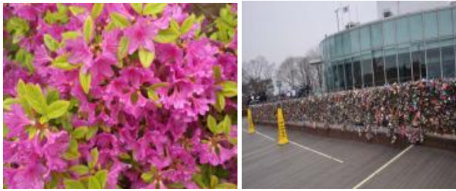
Fig.2. Digital camera images

improves the coding gain though not significant. On the average, the proposed algorithm improves 7.10% and 18.89% over JPEG2000 and JPEG-XR respectively.